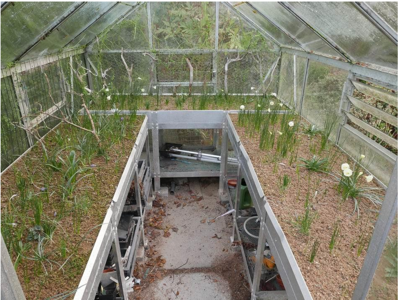
Moving over to what was the Fritillaria House before we converted entirely to mixed bulbs growing in sand beds. Our intention is to have flowers for as many weeks /months of the year as we can with the first two pictures taken this week followed by a small selection from earlier this year.