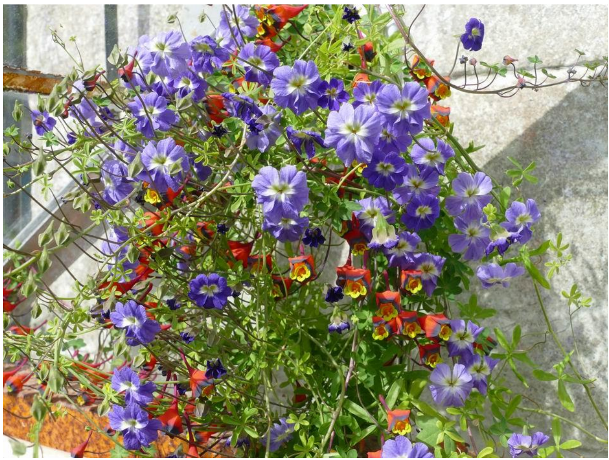
Tropaeolum azureum and T. tricolor climb up the mesh I have placed along some of the glasshouse walls.