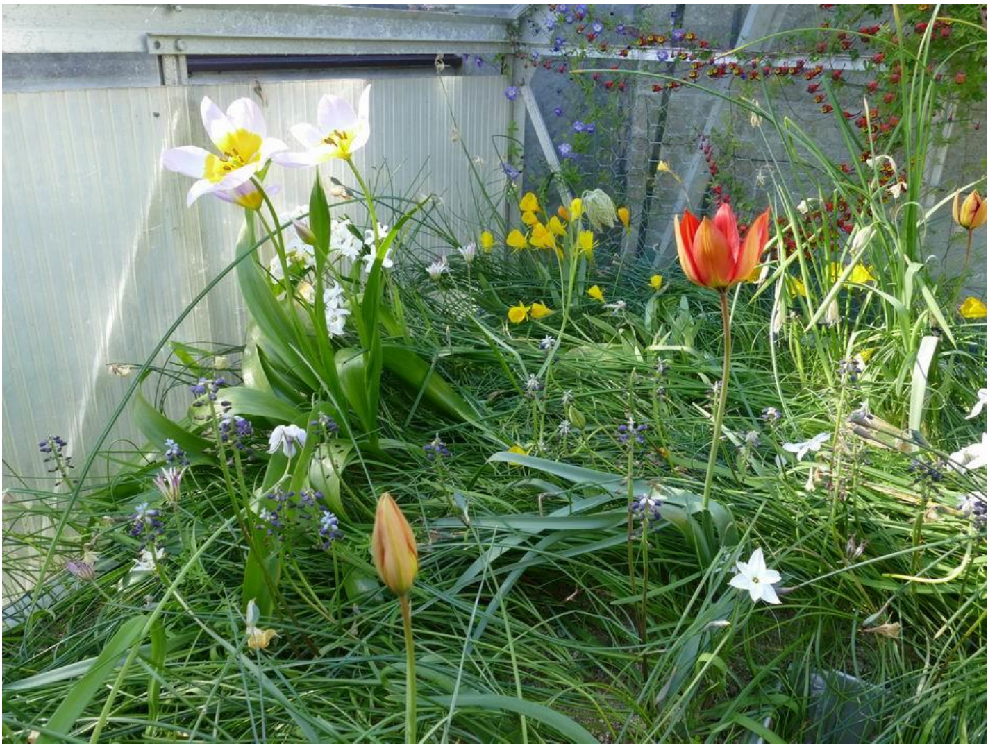
Some Tulipa and Fritillaria flowers join in.