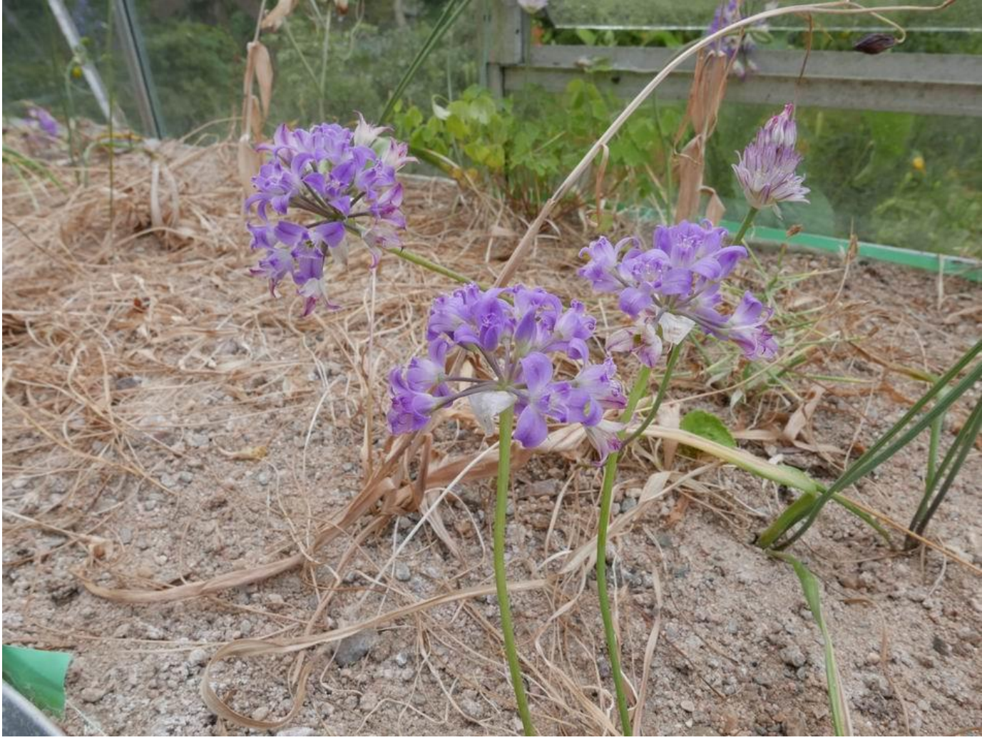
Allium crispum and Allium gomphrenoides