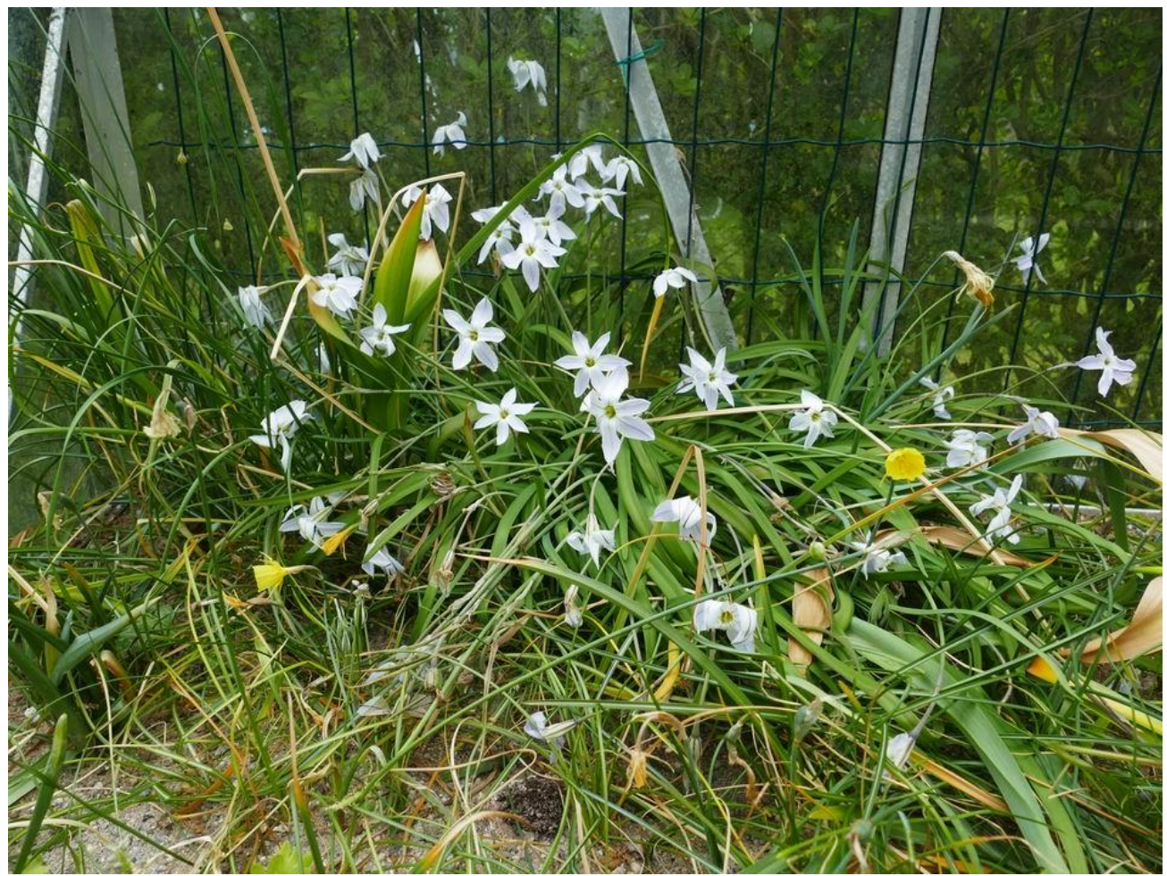
Ipheion are good for adding later flowers but they increase rapidly in the sand so I need to thin them out.