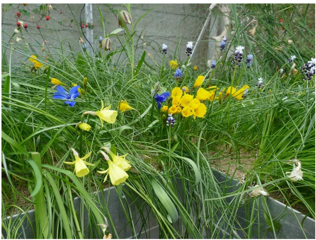
Tecophilaea cyanacrocus and Muscari sp. are mixed among the Narcissus.