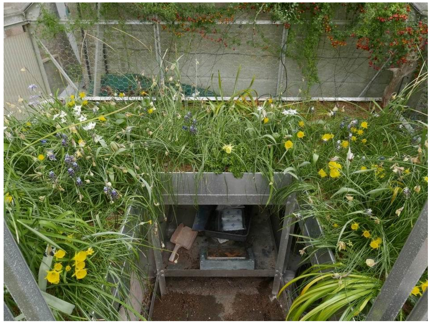
As the year progresses the flowers of those early bulbs fade and are replaced with waves of later flowering ones.

There now follows a photo-essay looking back at some of the sand beds trough the year starting with the 'U'shaped one. This picture, taken in mid-January, shows a stage of flowering close to what we have today in 2020, illustrating that the flowering time of these Narcissus varies considerably depending on the weather - as a result many of these narcissus are flowering for a second time in ten months.