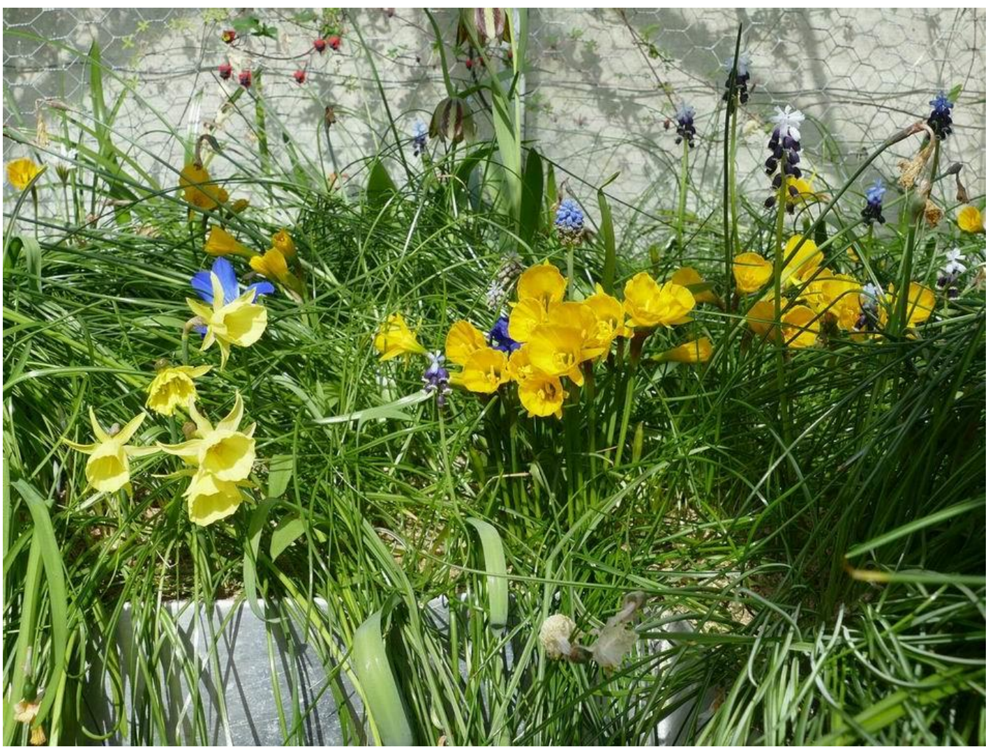
Narcissus including bulbocodium, obesus and hybrids.