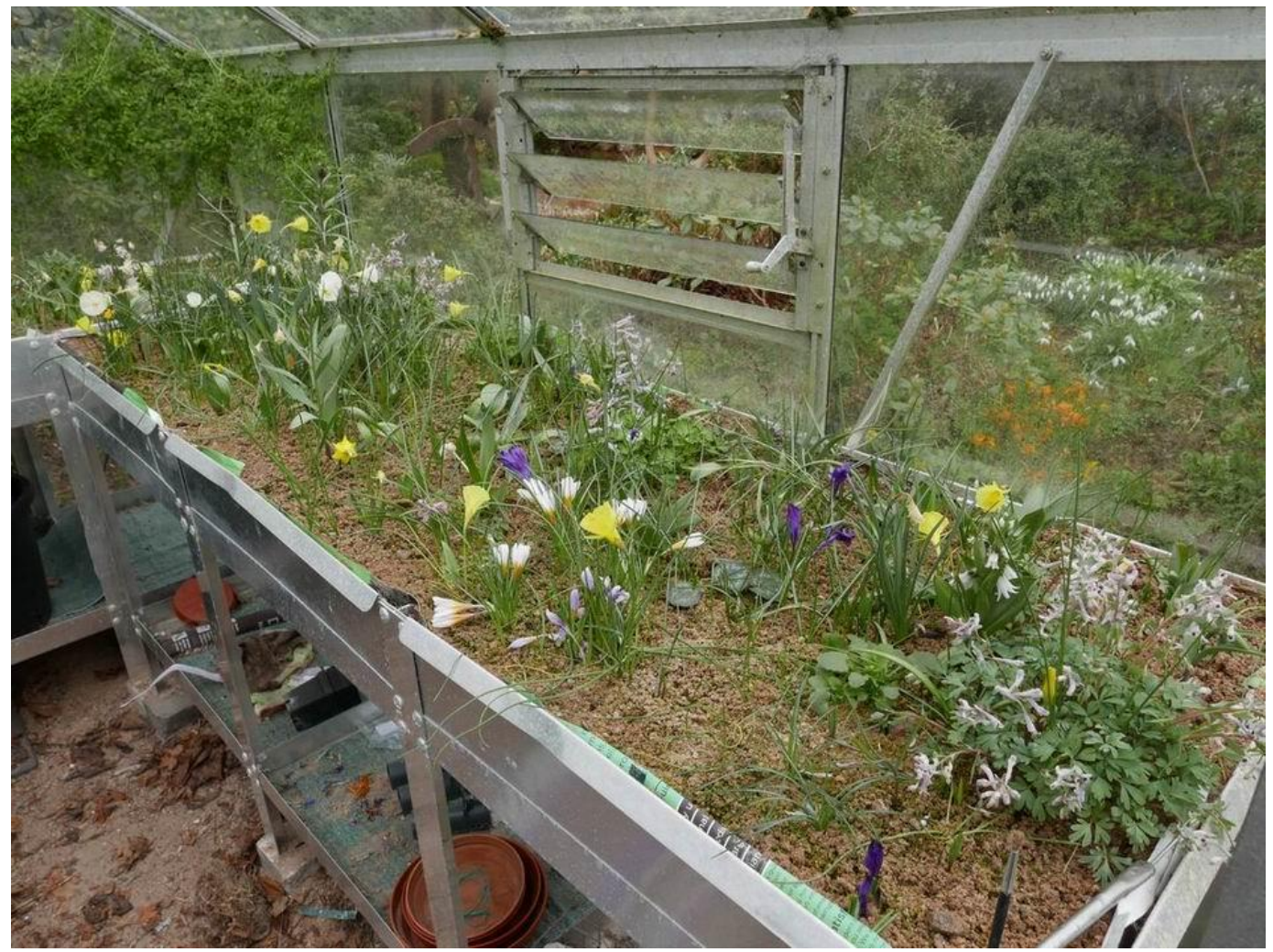
End of March.