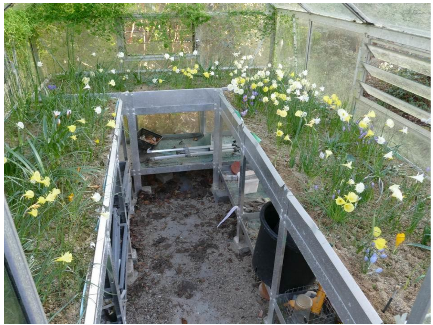
Now I jump back to the end of February.