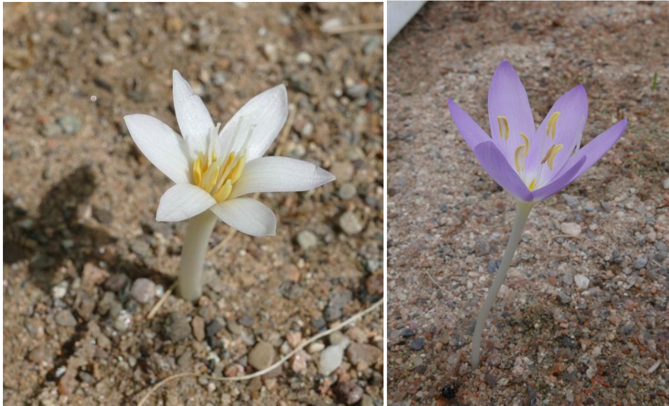
A white Colchicum species photographed on 28<sup>th</sup> July represents an early start of a new season of flowering in the sand beds - the only month we have not had a flower is when the sand is completely dry in August. On the right another Colchicum is the first into flower early in September after I have soaked the sand again.

The Triteleia and Alliums stop flowering towards the end of July which brings the season to a close but at the same time I spot a Colchicum shoot pushing though the dry sand heralding the first of the new season of flowering. I continue to seek bulbs that will fit in with the Mediterranean type season that will flower in the dry summer months