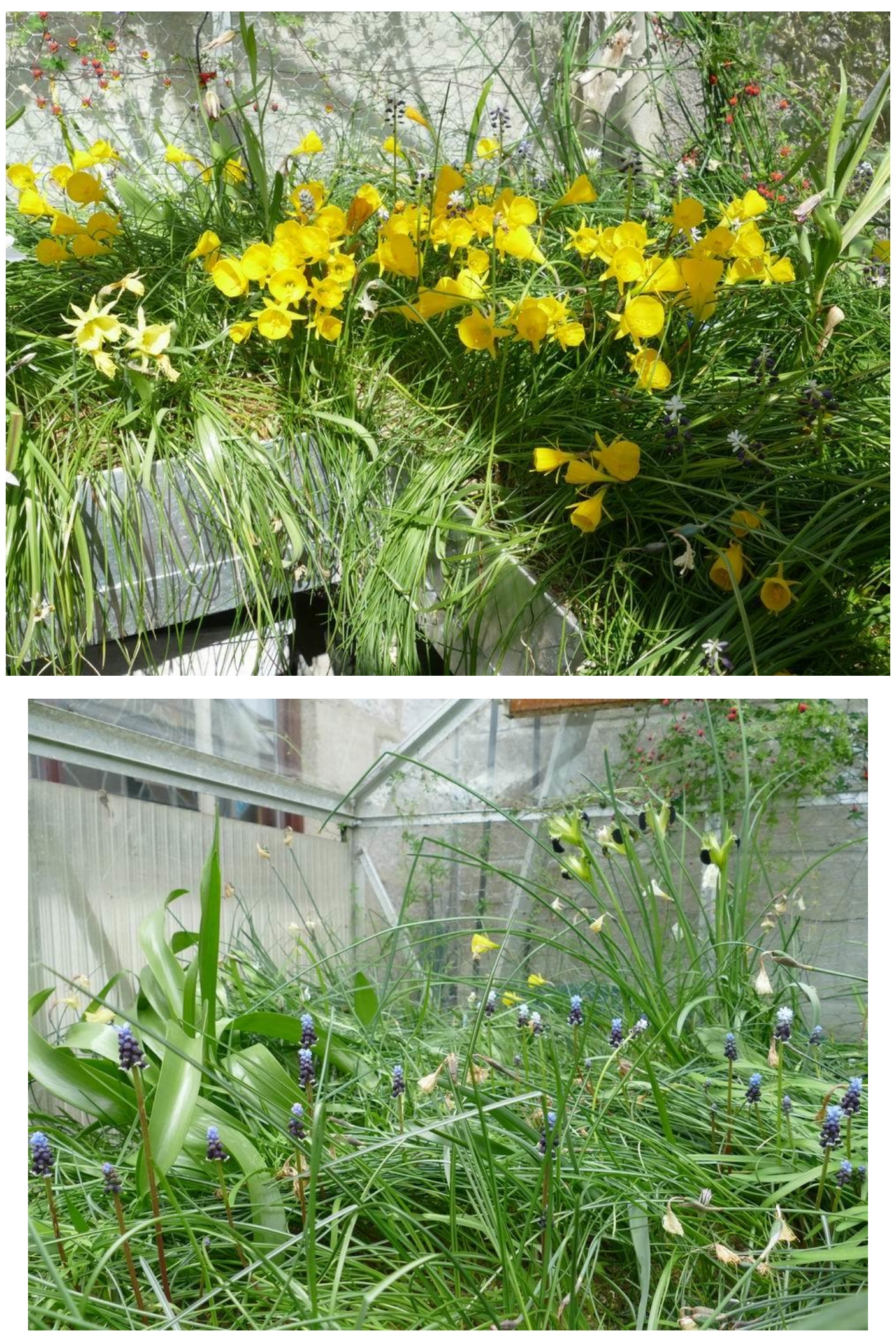
Eventually the Narcissus season starts to subside but there are plenty other bulbs flowering.