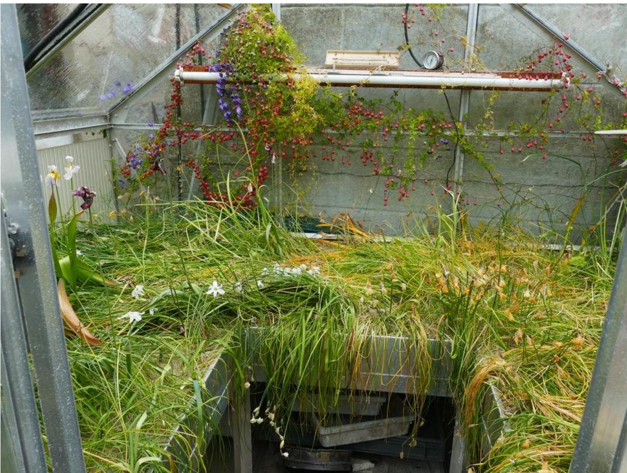
In this bed most of the flowering is over by the middle of May.