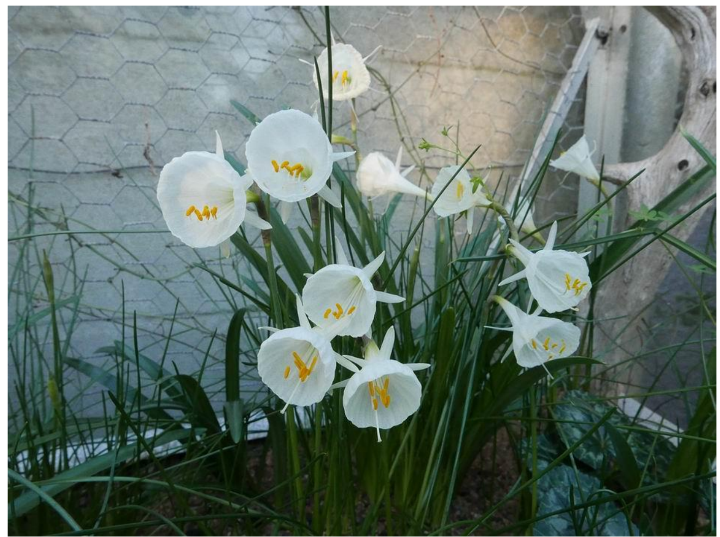
One seedling that does stand out, as in this mixed group, is Narcissus 'Craigton Chalice' . I first selected it from a pot of seedlings with the intention of bulking it up by growing it in a pot however one year when reporting I found a pot that had lost its label so in a rash moment I decided to spread those bulbs through the sand bed only to discover in the flowering season that those were my Craigton Chalice bulbs.

All was not lost because I still had the bulbs they were just mixed through with several hundred others. One thing my mistake did confirm was the bulb I hope to distribute as Narcissus 'Craigton Chalice' is distinct and stands out clearly from the masses. I rescued some bulbs from the sand and now I have two pots to work on bulking it up again. Another interesting observation is that the exact same clones flower much earlier in the sand beds than they do in pots. These are the still tight buds of 'Craigton Chalice' still some weeks off flowering, while the ones in the sand have already been flowering for a few weeks.