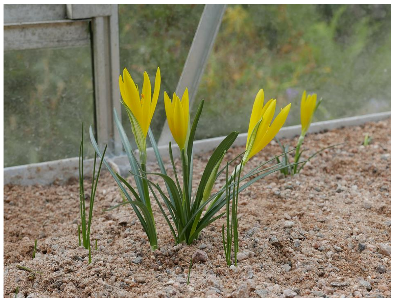
September also brings the first of the Sternbergia sicula flowers and we don't have long to wait before the Narcissus start flowering again in October.

In September growth is apperaing both leaves and flowers such as Cyclamen mirabile along with Crocus species.