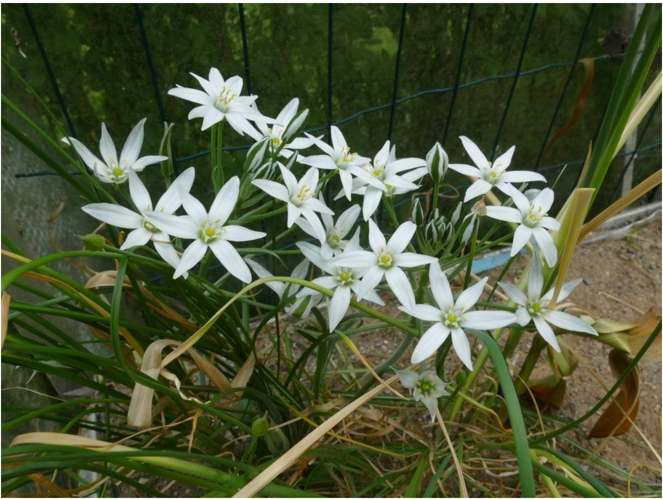
We have a number Ornithogalum sp . that flower through the warmer months.