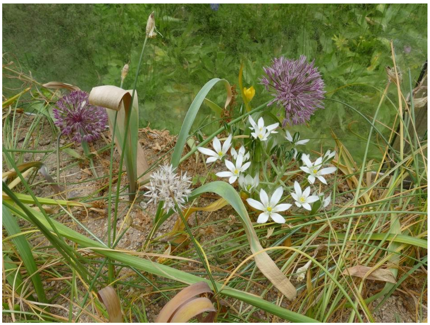
There are a number of smaller Allium species that flower through May into June.